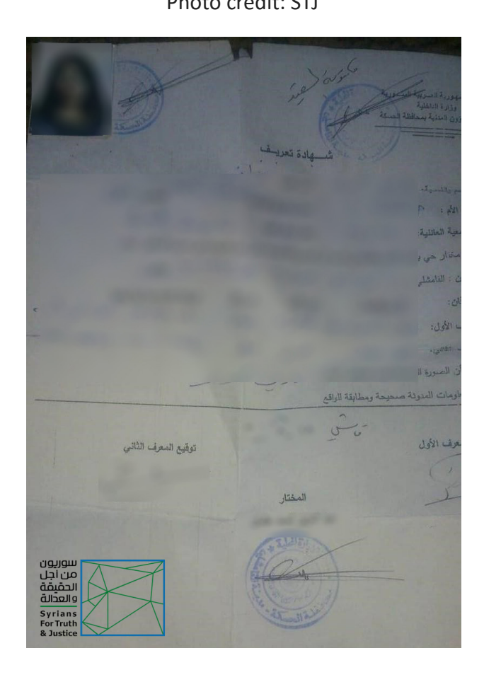
Identification certificate issued by the Mukhtar for maktumeen